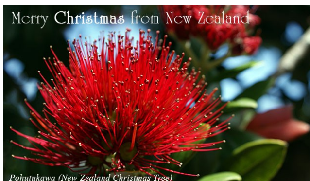
Pohutukawa (New Zealand Christmas Tree)

As this is the last newsletter for the year, the Committee join in wishing you a festive Christmas/New Year season. May you catch up with a lot of family - and record all your own memories as well.