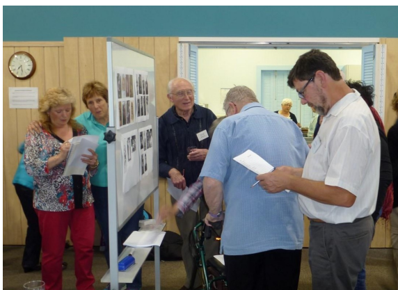
'Who do you think this is' quiz!

Thanks also go to the committee members for making the night a success, as well as the various branch members who pitched in to help on the night.