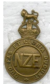
NZ Tunnellers Badge