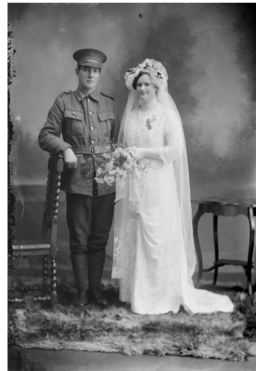
Title: Baker; Date: 1914-1918