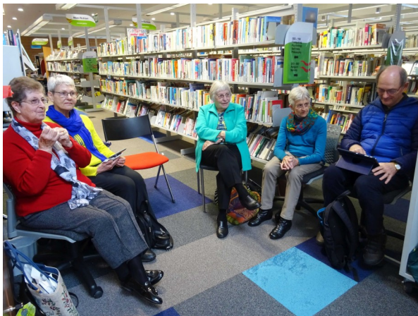
Meeting of the Australian Interest group