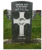
Roll of New Zealand's Second World War Dead