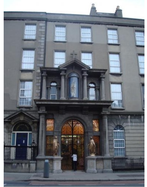
aka Our Lady of Mount Carmel

The inner box of the shrine which contains " the sacred body of Saint Valentinus the Martyr, together with a small vessel tinged with his blood " has never been opened nor seals broken to disturb his final resting place.