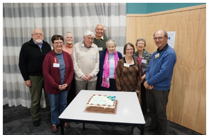
Some members of the Branch in its early years