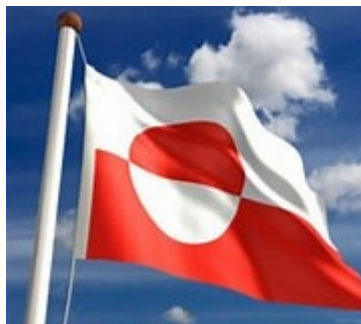
Flag of Greenland National Day is June 21st.