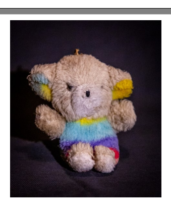
Have you got a family treasure or heirloom in the attic?

Please bring it to the Show and Tell at our next evening meeting on Tuesday, or to the day meeting on Wednesday afternoon. We'd love to share its story.