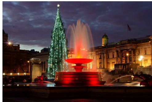
Trafalgar Square, London, at Christmas with the National Gallery in the background.

This is the last newsletter for this year. Thanks to those who have contributed during the year,