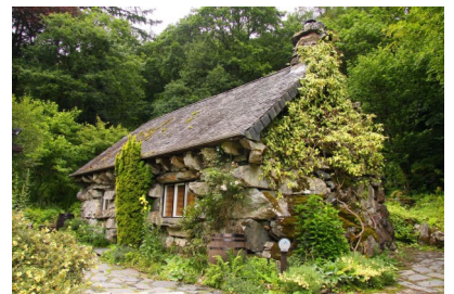
An Example of Ty Unnos - a one-night house.

The Genealogist has now completed the 1910s land tax records for Bedfordshire and Hertfordshire. These Lloyd George Domesday Survey records are a fully searchable resource that family and house historians will find invaluable in their research. Using the field books and maps enables you to discover more about the type of property that your ancestors had once occupied and to see the actual location on a range of contemporary and modern maps.