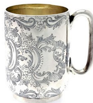
Not the original mug. For illustration only