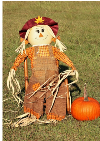
Harvest Festival time

1812-1857, who was a victim of the the Indian Mutiny in 1857. Why am I interested?